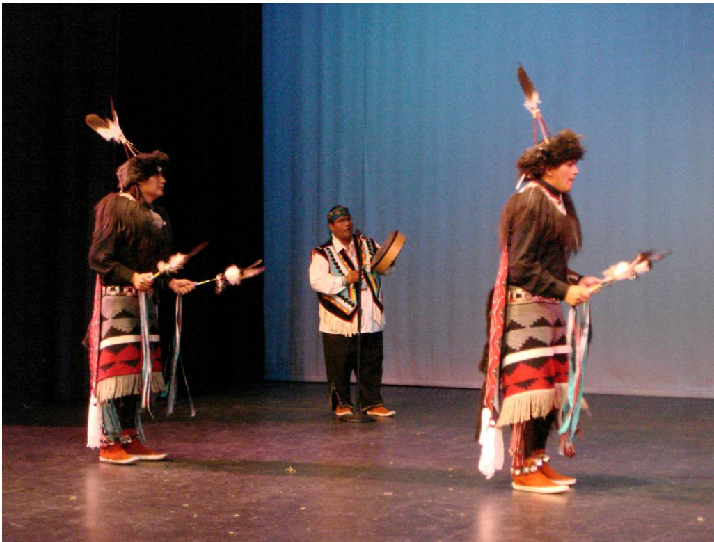
Pollen Trail Dancers

The event was a success as stated by those in attendance and the vendors and performers present.