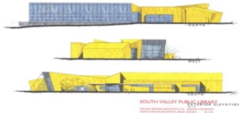
Washoe County Library Plans for new South Valley Public Library