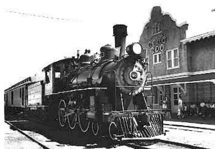
Ghost Train Ely, Nevada

This is a marvelous collection of authentic railroad equipment from one of the west's last great mining