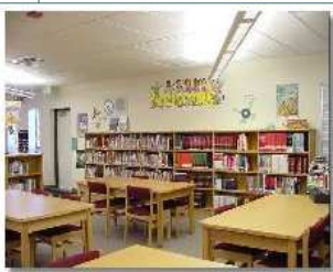
Jackpot Branch Library, Elko-Lander-Eureka County Library System

NLA will raise awareness of library issues both within the library community and to legislators and other relevant parties in the general population.