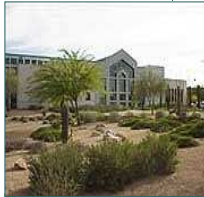
West Charleston Library, Las Vegas-Clark County Library District

The Nevada Library Association was formed in 1946 to act as a clearing house for library information in the state as well as a forum for presenting new ideas. The organization also acts to broaden the scope of library service and to call attention to the work of Nevada libraries.