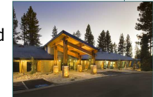
Incline Village Library, Washoe County Library System

View a full list of Groups at nevadalibraries.org